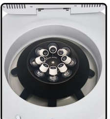
5-7ml Blood Collection Tubes*

Benchmark's LC-8 series of laboratory centrifuges is uniquely designed to meet a wide range of applications in both the clinical and research laboratory. An eight position rotor is included and designed to directly accept 10ml and 15ml test-tubes (conical or round bottom), while optional adapters are also available for use with all popular sizes of blood collection and culture tubes. Unlike most compact centrifuges in this class, the rotor can be easily removed from the chamber for cleaning.