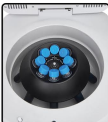
15ml Conical Centrifuge Tubes