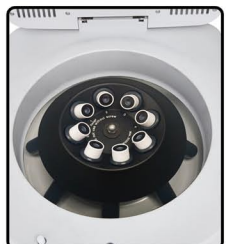
10ml Blood Collection Tubes