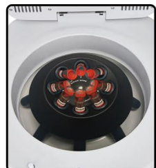
15ml Blood Collection Tubes